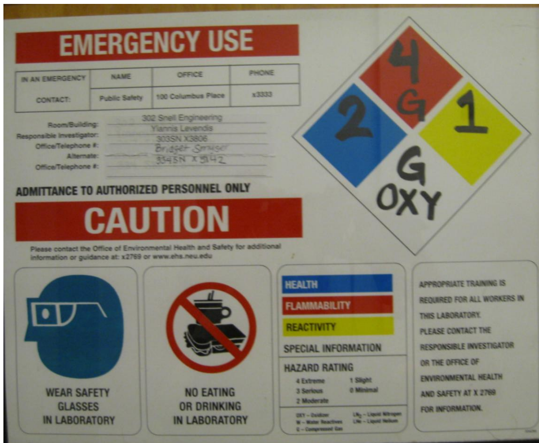
FIGURE 2: EXAMPLE OF LABORATORY SIGN

quadrant (white) is used to indicate special hazards: water reactivity, radioactivity, biohazards, or other hazards. The higher the hazard rating on the NFPA diamond, the higher the hazard. An example of the EHS sign program is located in Figure 2 below (302SN).